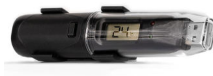
CMDL01 Advanced Data Logger with LCD Display