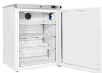
CMG125 Medium Glass Door Refrigerator