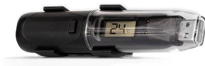
CMDL01 Advanced Data Logger with LCD Display