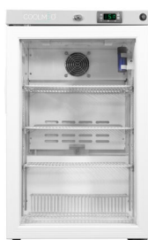
CMG125 Medium Glass Door Refrigerator