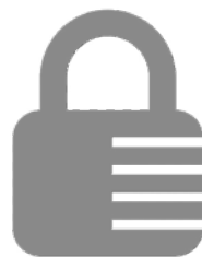
COMBI01 Keyless Combination Lock-Per Lock