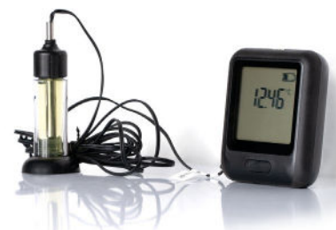
EL-WIFI-VAC WIFI Data Logger