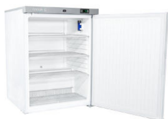
CMLFR145 145L Spark Free Lab Fridge