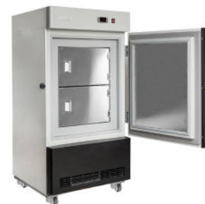
CMF86V80 -86°C Ultra Low Temperature Freezer