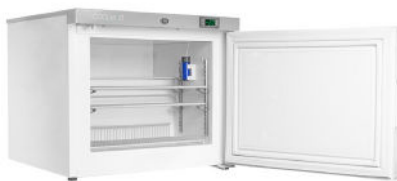
CMLFZ47 47L Spark Free Lab Freezer