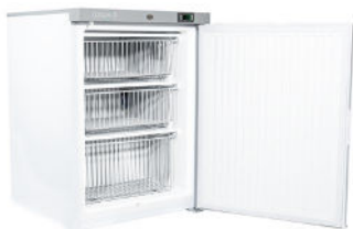
CMLFZ115 115L Spark Free Lab Freezer