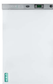
CMRTSS59 59L Solid Door RTS Cabinet