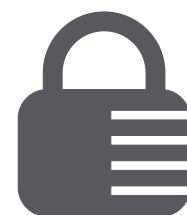
COMBI01 Keyless Combination Lock