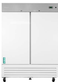
CMRTSS500 500L Solid Door RTS Cabinet